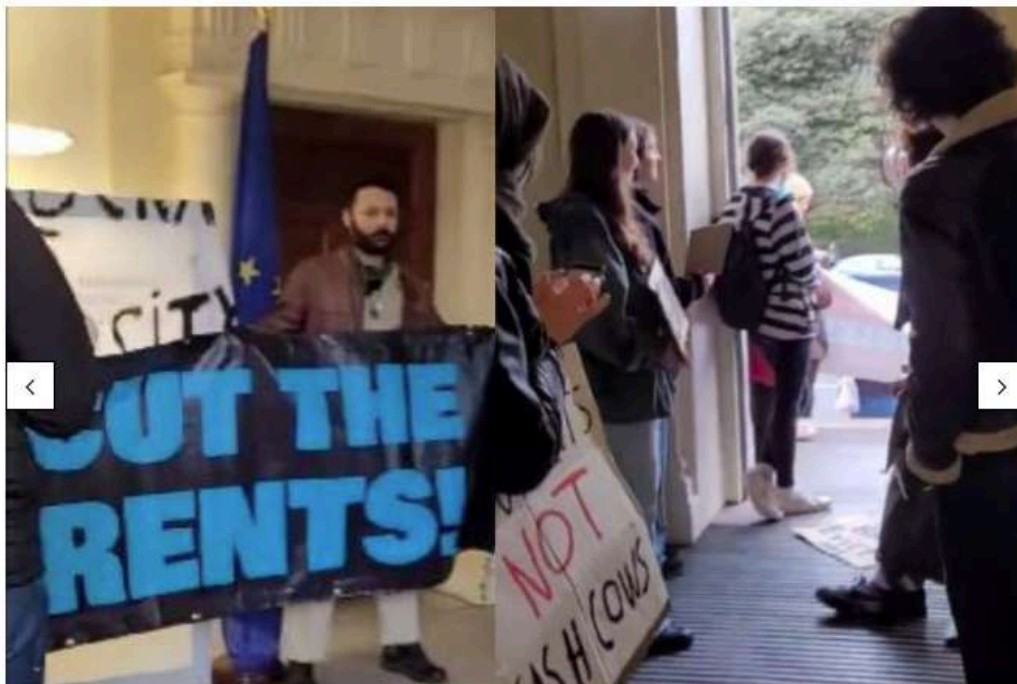
Department of Further Education occupied by students and researchers