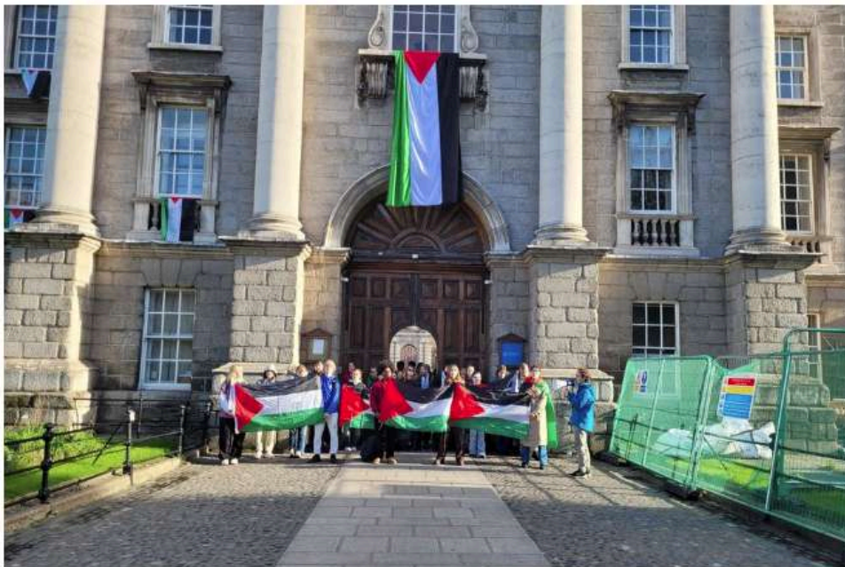
Trinity College Dublin Students' Union blocking the front entrance of the university in protest against the university's links with Israel.

Campaign group said ties with Israel make ‘every member of the college community complicit in Israel’s crimes and oppression of Palestine’